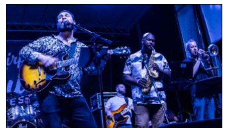
Miller and The Other Sinners