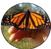
Eastern Monarch Butterfly Farm