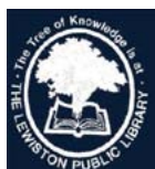
Lewiston Public Library